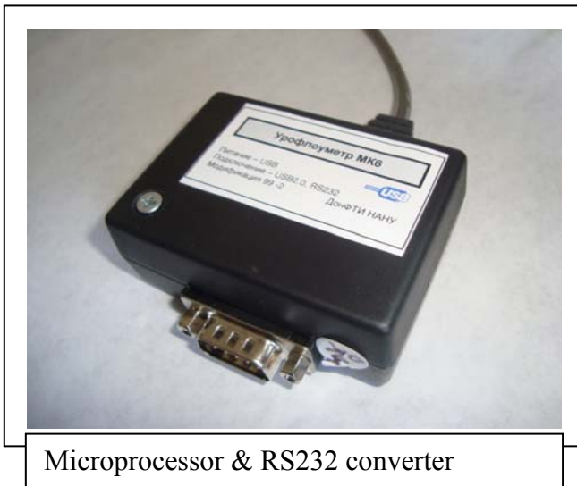
Microprocessor & RS232 converter